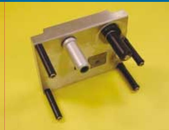
The easy-load Coder 60 magazine