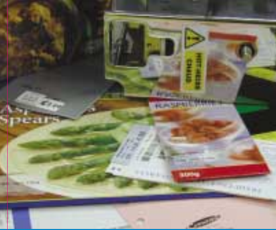
Hot Foil - clear, clean and versatile