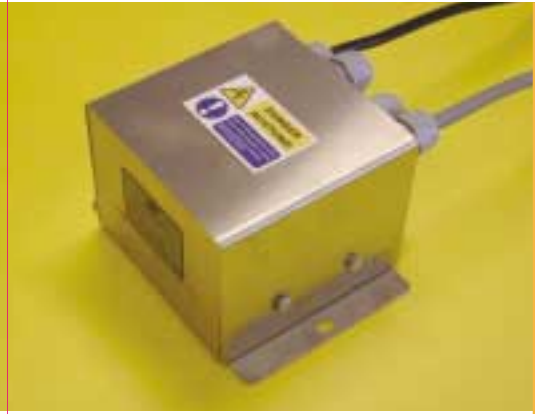
System Pack - pre-wired for ease of installation