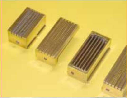
Comprehensive range of typeholders