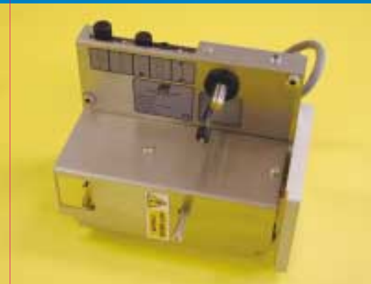
The Coder 60 printhead