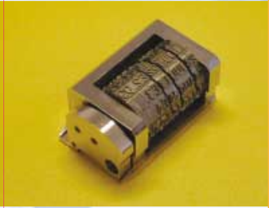
Both mechanical pin and ball & spring rotary typeholders are available

The Coder 60 coder kit is designed to facilitate easy installation on a wide range of packaging machines whilst maintaining maximum performance. All controls are housed in either the coder or a single "System Pack" that doubles as a connection centre and is supplied pre-wired for mains and coder connection.